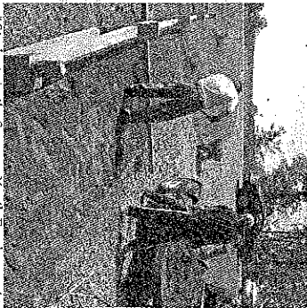
Students in the Summer Youth Employment Program and Greg Bennett working at the narrows across the street from the public access.

Service and they had students from East Central High School who were interested in helping the Big Pine Lakes